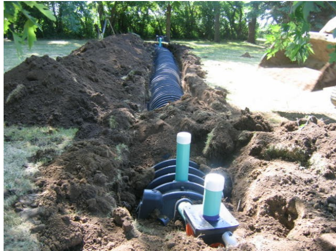
Septic System being installed in Pipestone County