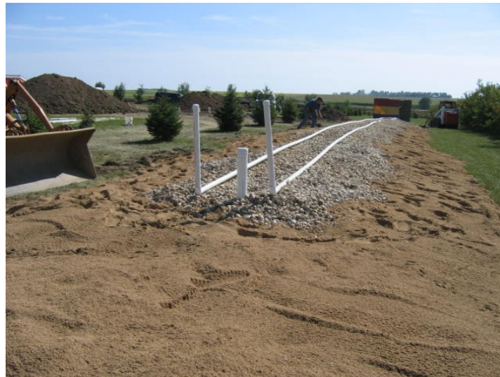
Septic System being installed in Pipestone County